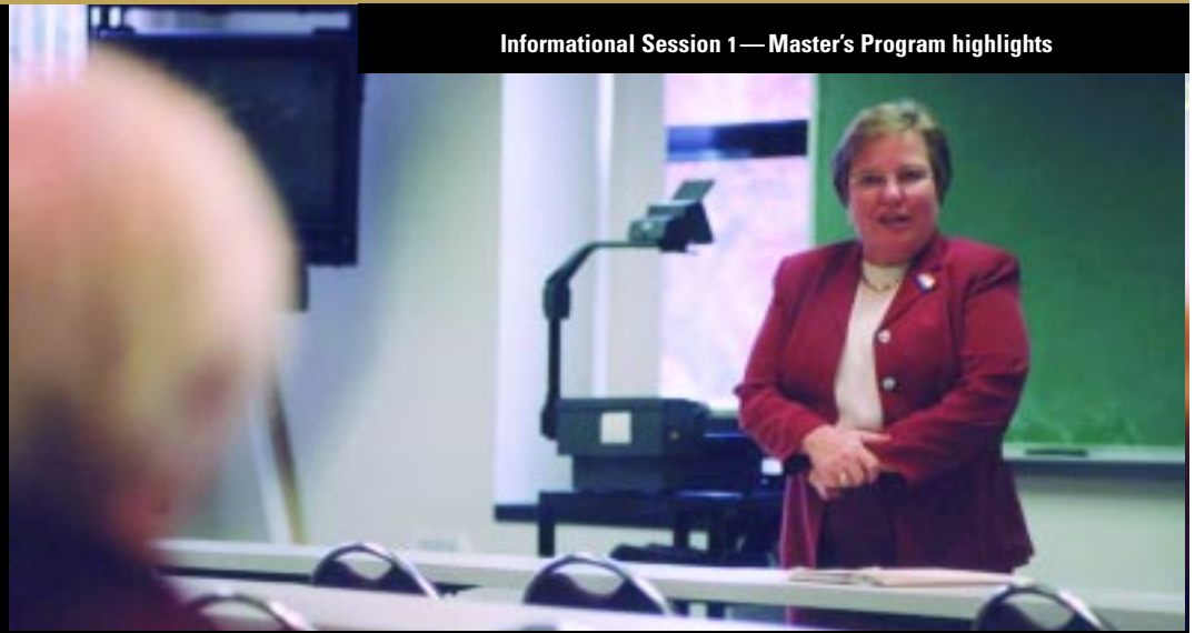
Informational Session 1—Master's Program highlights