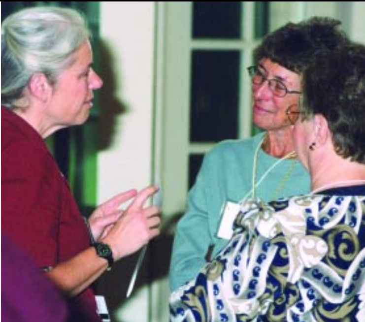
School of Nursing luncheon