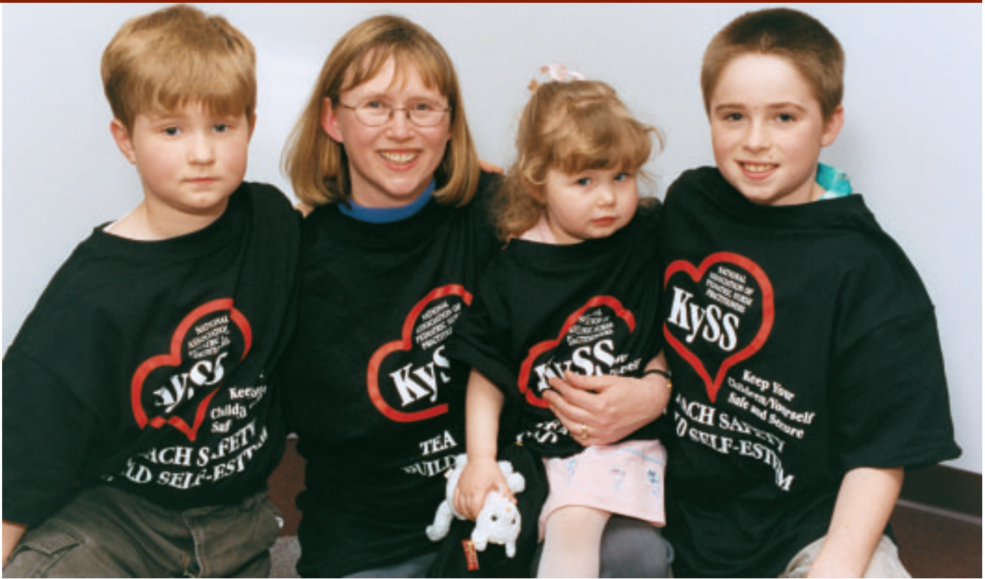
The new Pediatric Nurse Practitioner and Psychiatric Mental Health Nurse Practitioner Master's Program will teach students how to assess and treat common emotional and behavioral disorders in children and teens in the primary care setting, issues that also are being addressed through the KySS campaign.