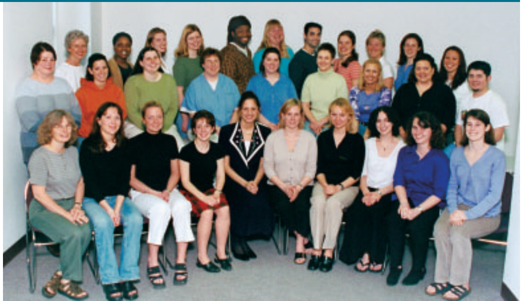
The School of Nursing's last four-year nursing class graduates in May.

THE DECISION TO phase out the traditional bachelor's degree curriculum was a result of the competitive world of nursing schools. It has developed into an opportunity for us to now focus even more intently on the key aspects of the School's prominence, particularly graduate-level offerings and research efforts, and we will continue to maintain the highest standards in nursing practice, education and research as we move forward with our comprehensive strategic plan.